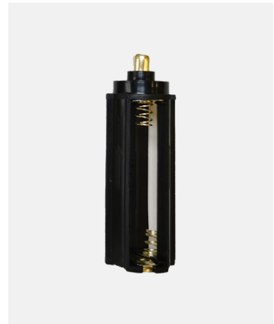
G257-1 BATTERY CARRIER For 3x AAA battery