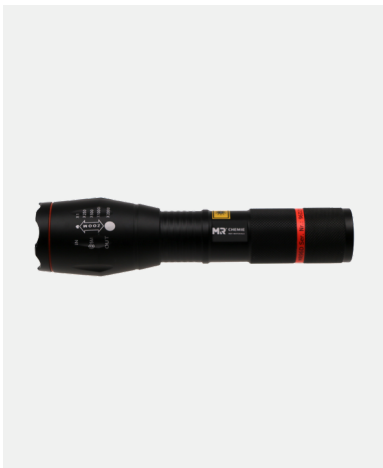
MR 96 D UV LED flashlight