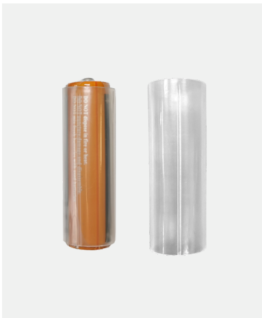
LITHIUM-ION BATTERY + ADAPTER Type 18650 Please remove battery foil before use!