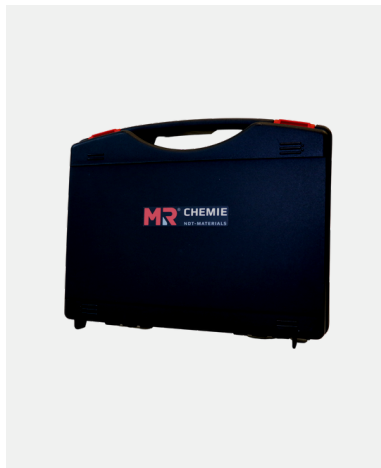
96D CASE Suitable for MR 96 D