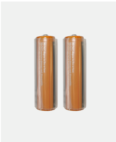
2X LITHIUM-ION BATTERY 97-2 Type 18650