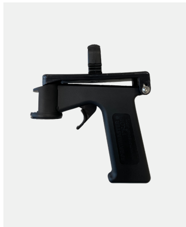
SPRAY AID Ergonomic